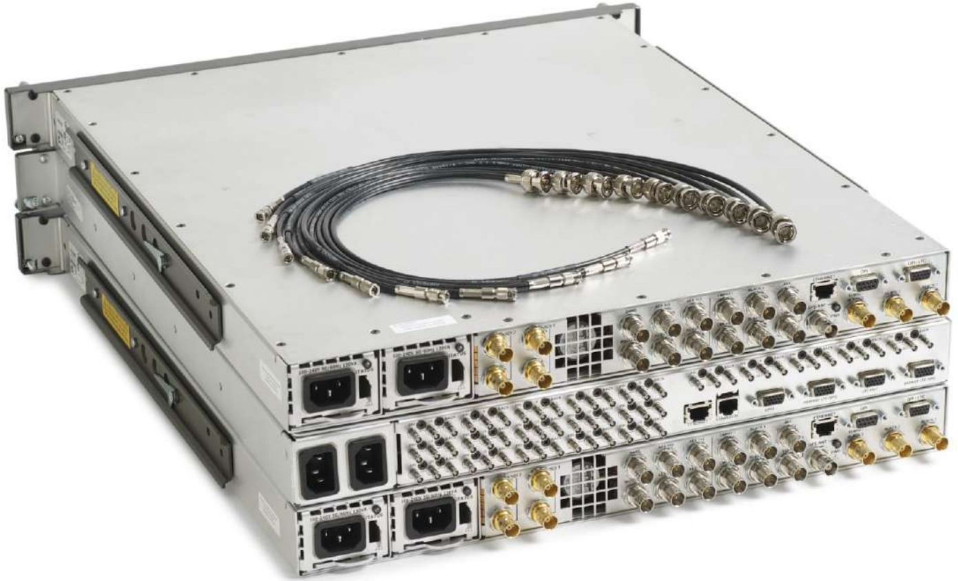
Option CBL adapter cable