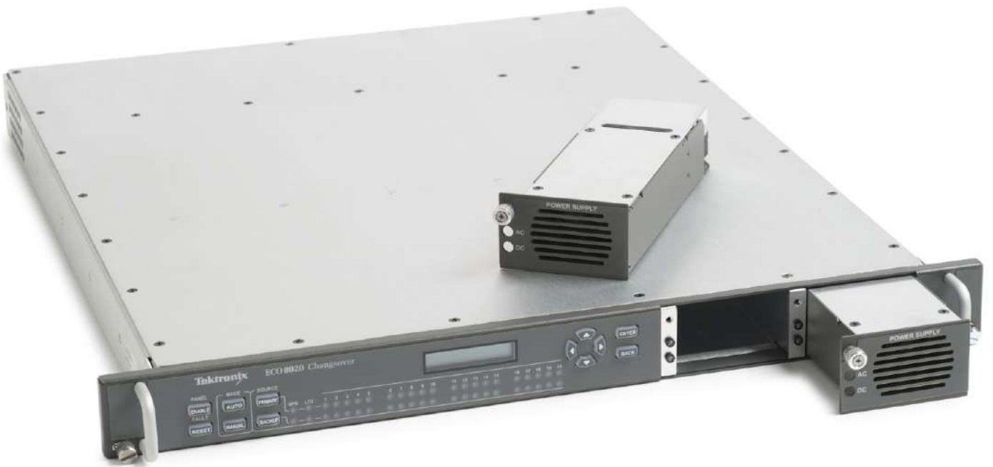
Option DPW backup power supply