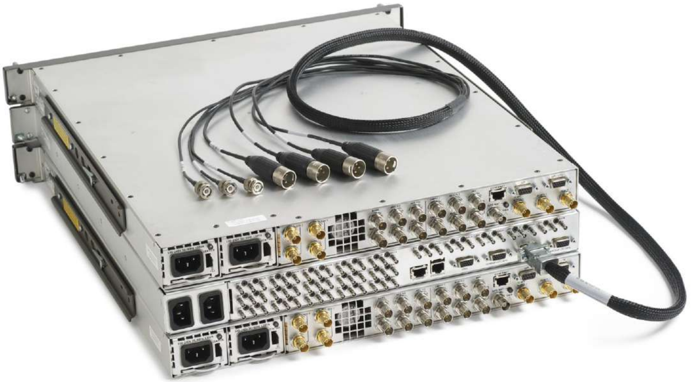
Option XLR adapter cable