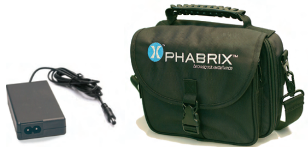
AC Power Supply and Carrying Case as standard