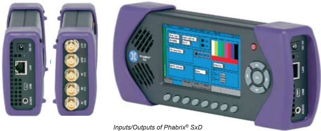
Inputs/Outputs of Phabrix® SxD