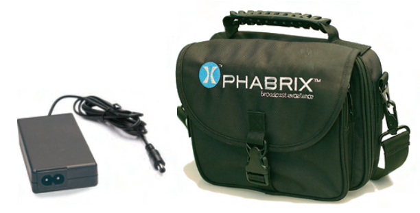
AC Power Supply and Carrying Case as standard