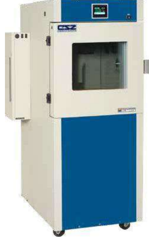
MC-3 shown with optional window and humidity

Optional equipment is economically priced to enhance performance and customize your chamber to meet your needs. A complete selection of optional accessories are available.