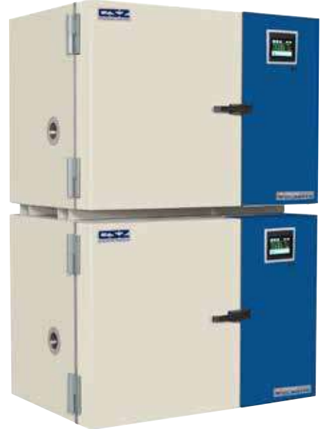
MicroClimate Benchtop Temperature Chamber shown in the stacked position.

These chambers are designed to provide users with a compact chamber for testing small components and products for a variety of industries. Whether you need to perform temperature cycling tests or expose your product to steady state temperature environments, these chambers will maintain precise and accurate temperature/humidity control throughout your test. Choose from benchtop and reach in models to fit your laboratory testing needs.