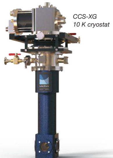
CCS-XG 10 K cryostat