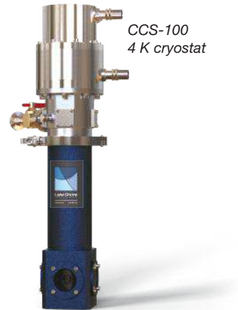
CCS-100 4 K cryostat