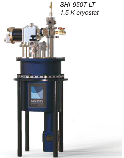
SHI-950T-LT 1.5 K cryostat

Our CCR designs begin with cryocoolers supplied by several of the world's leading manufacturers of cryogenic refrigerators. We have designed and built CCR systems for an extremely broad range of applications including VSM, Mössbauer, matrix isolation, Hall measurements, microwave device cooling, detector cooling, x-ray and neutron diffraction, and many more. Temperature ranges are available from 7 K to 800 K.