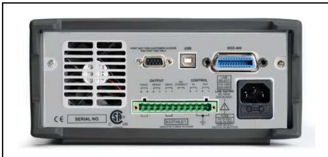
Series 2200 rear panel.