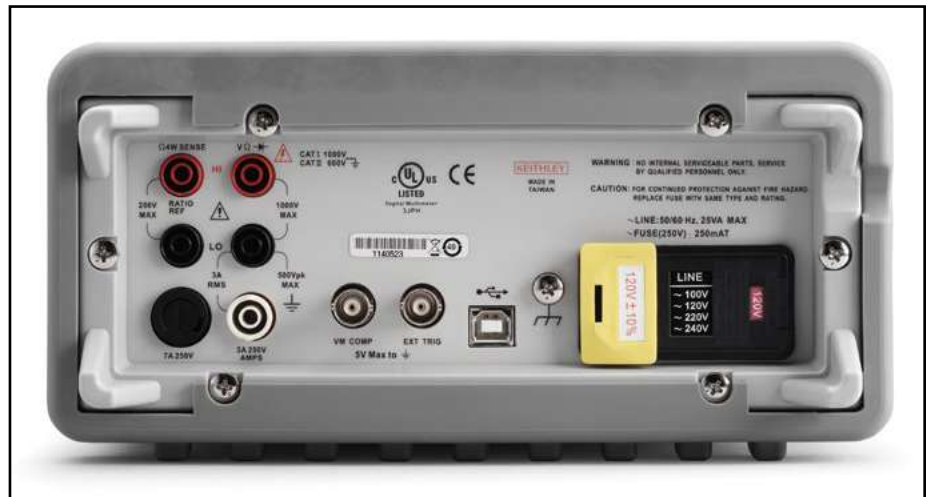
Model 2100 rear panel

AC CMRR: 70dB (for 1kΩ unbalance LO lead). POWER SUPPLY: 120V/220V/240V. POWER LINE FREQUENCY: 50/60Hz auto detected. POWER CONSUMPTION: 25VA max. DIGITAL I/O INTERFACE: USB-compatible Type B connection. ENVIRONMENT: For indoor use only. OPERATING TEMPERATURE: 5° to 40°C. OPERATING HUMIDITY: Maximum relative humidity 80% for temperature up to 31°C, decreasing linearly to 50% relative humidity at 40°C. STORAGE TEMPERATURE: –25° to 65°C. OPERATING ALTITUDE: Up to 2000m above sea level. BENCH DIMENSIONS (with handles and feet): 112mm high × 256mm wide × 375mm deep (4.4 in. × 10.1 in. × 14.75 in.). WEIGHT: 4.1kg (9 lbs.). SAFETY: Conforms to European Union Directive 73/23/ECC, EN61010-1, UL61010-1:2004. EMC: Conforms to European Union Directive 89/336/EEC, EN61326-1. WARRANTY: One year.