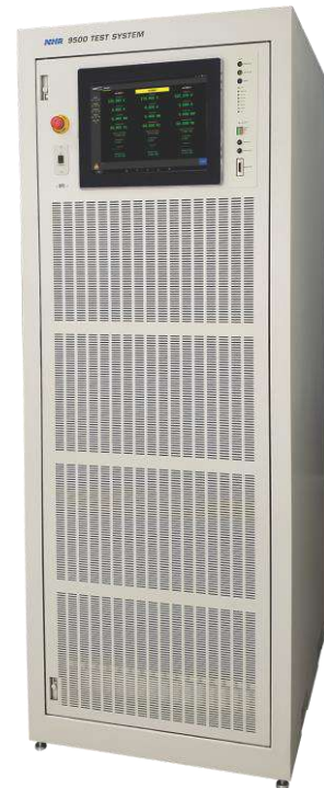
Figure 1- Regenerative Grid Simulator - 9510

Sustainability initiatives across the globe are accelerating the electrification of vehicles, charging infrastructure, new energy deployments, and grid modernization. Increasing demands on the grid and new opportunities for distributed energy resources such as solar, wind and energy storage, require modern test solutions to simulate the grid.