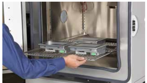
Adjustable product shelf slides out for easy access to your product