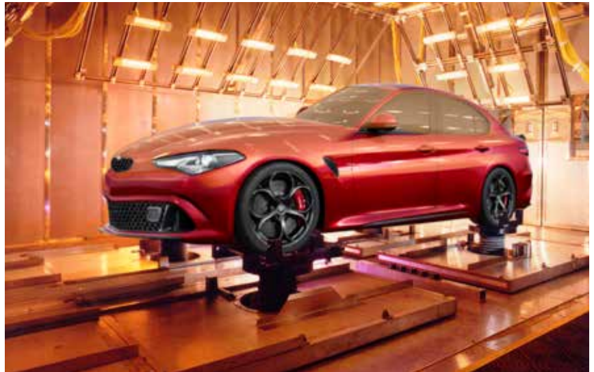
Four post road simulator with temperature, humidity, vibration and solar simulation.

Testing procedures include noise, vibration, climate conditions, suspension systems, shocks, squeaks and rattles. Every chamber can be tailor-designed to meet different requirements and specifications and can integrate with vibration systems.