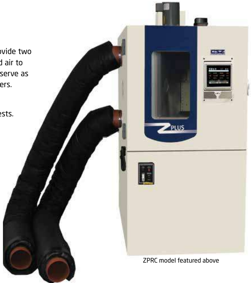
ZPRC model featured above