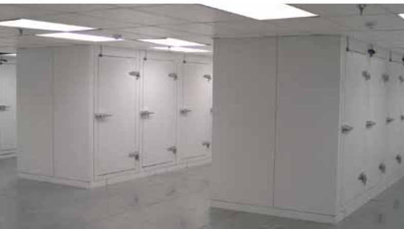
BioStore Freezer Rooms

These Freezer Rooms consist of hallways with multiple freezer compartments on both sides. Ideal for large capacity storage to replace upright freezers with a single unit.