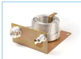
Opt-02 TK-10DN Low P1M Cable Load, 40W, with 7/16'' (f) & N(f) connectors (at either end of cable)