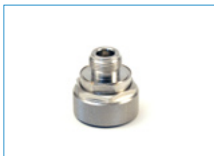
ZB-B06 Connector Adaptor, 7/16''(m) - N(f)