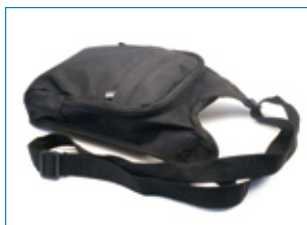
ZB-B07 Accessories Pouch