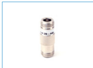
Opt-05 ZB-A98 Connector Adaptor, N(f) - N(f)