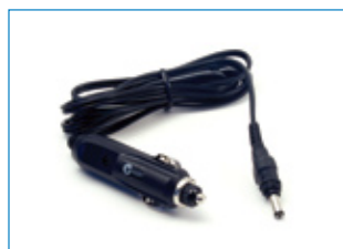
ZB-B08 DC Charging Cable for Car Accessory Socket