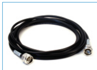
ZB-B05 Test Cable, Type N(m) - N(m), 4m (13 ft)