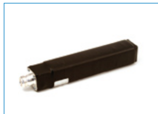
Opt-01 TK-A01 Low P1M Cable Load, 5 W, N(f) connector