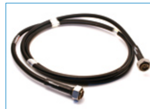
Opt-07 ZB-B11 Test Cable, 7/16''(m)-7/16''(m), 3m (10 ft)