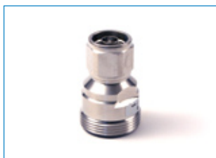
Opt-04 ZB-A97 Connector Adaptor, 7/16''(f) - N(m)