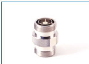
Opt-03 ZB-A96 Connector Adaptor, 7/16''(f) - 7/16''(f)