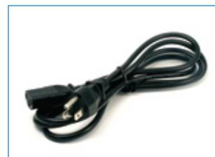
ZB-B04 Power Cord, 2m (6 ft)