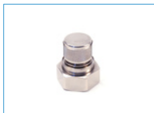
Opt-06 ZB-B09 Low power P1M source, 7/16''(m)