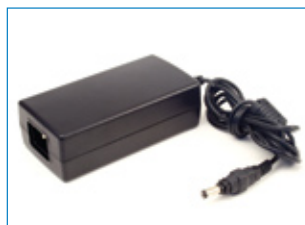
ZB-B03 Power Supply, 90 - 264 VAC / 12 VDC, 4 Amp